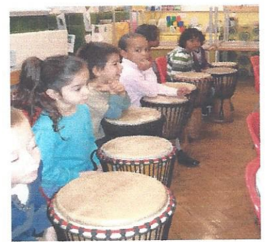
Black History Month